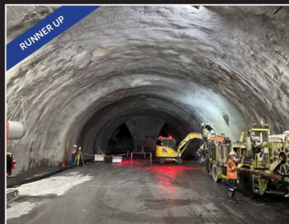
Infill spraying process - Sprayed shotcrete process creating tunnel profile arch. Brisbane Metro Acciona ARUP JV