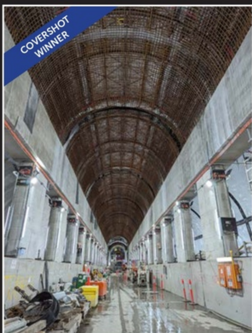
An assembly of self-supporting prefabricated arch reinforcement cage in the Town Hall Station cavern beneath Swanston Street. Melbourne Metro Tunnel Project