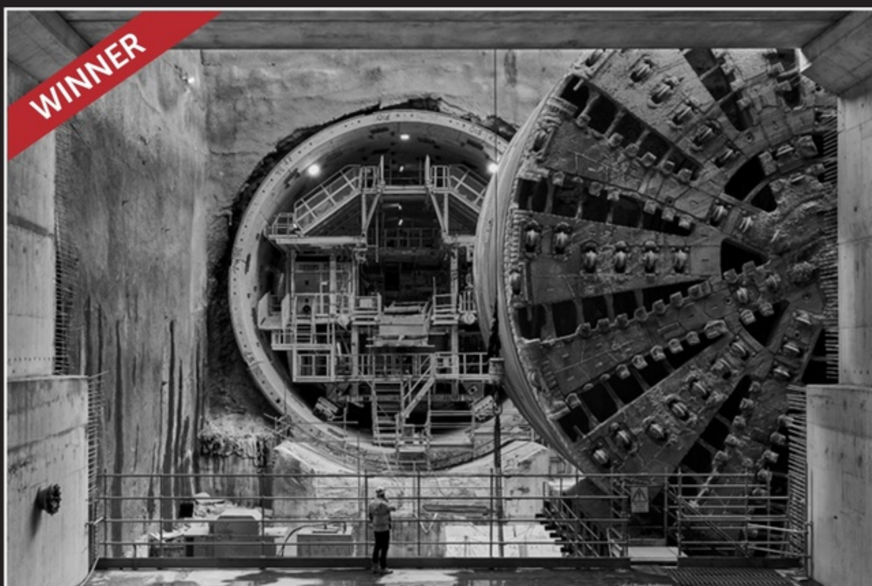
Moving the largest TBM in the southern hemisphere, by Taibel Rosas R.

Thanks to all the amateur photographers who submitted images for this competition. The next Photography Competition will open 1 July 2024, so get snapping now!