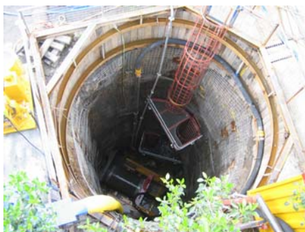
Figure 2: The finished shaft