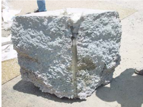
Figure 3: A fragment from the PCF blast of concrete

The block split into four approximately equal larger pieces and four smaller but still significant smaller pieces. There was minimal fines and small fraction produced. The throw on this blast was much greater than on any of the previous blasts, with large fragments landing up to 8.4 m away. One fragment from the blast is shown in Figure 3.