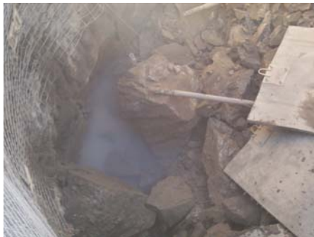
Figure 1: After firing of the shaft using Cardox